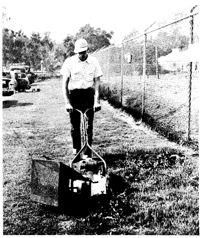
ROTARY MOWER WITH GRASS CATCHING ATTACHMENT