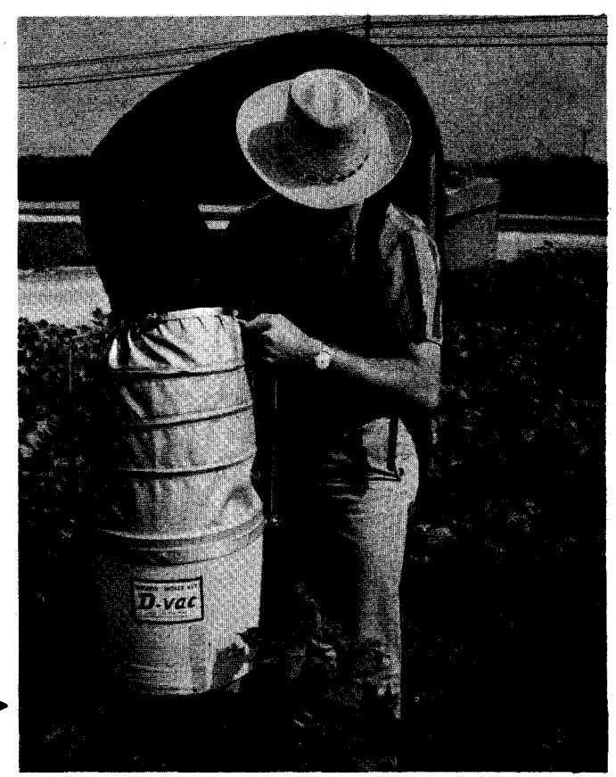
Fig. 2 D-Vac collecting equipment

In summarizing the results, two applications of one of the granular materials will control the chinch bugs. Along with the insecticidal treatments, it should be stressed that good cultural practices, such as fertilizing, aeration or thatch removal and watering will help reduce the insect damage to the lawn as the pest seems to attack where the grass stand is the weakest.